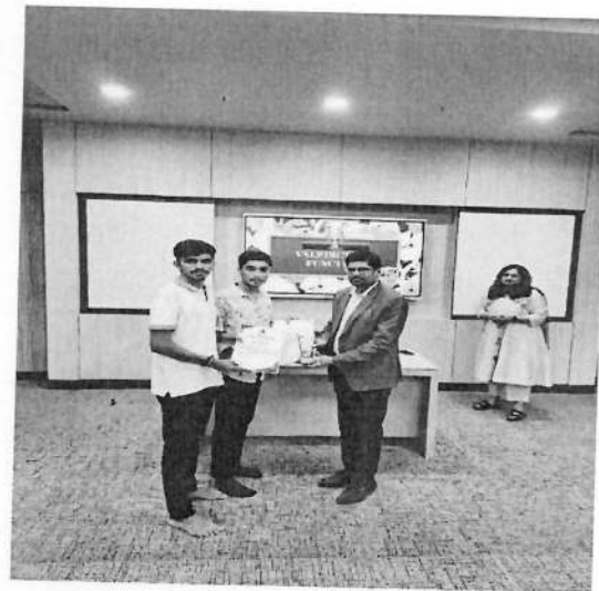
Prize distribution to Winners & Runners