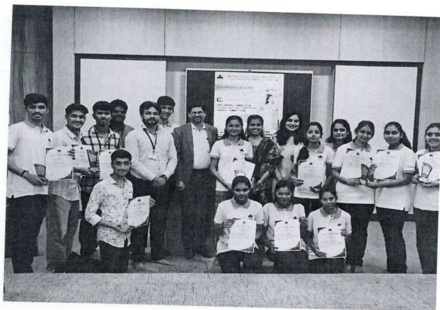
Awardees with Principal & Teachers