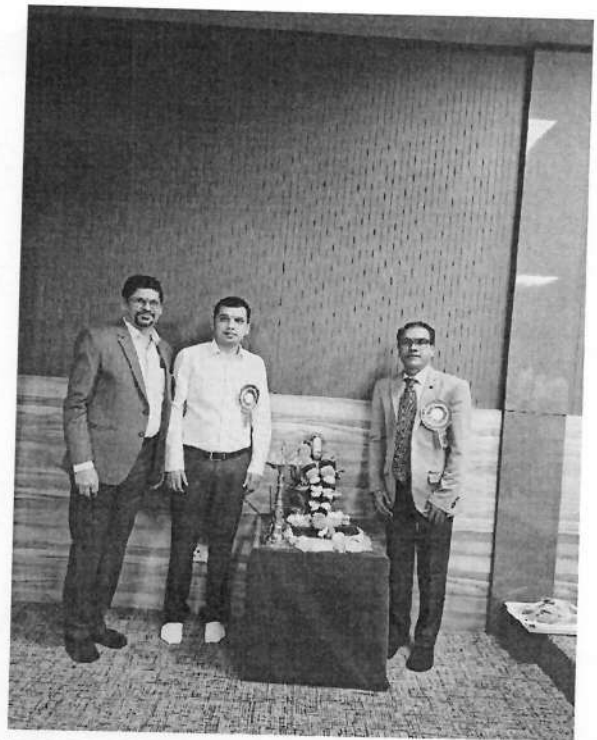
Saraswati Poojan & lightening of lamp