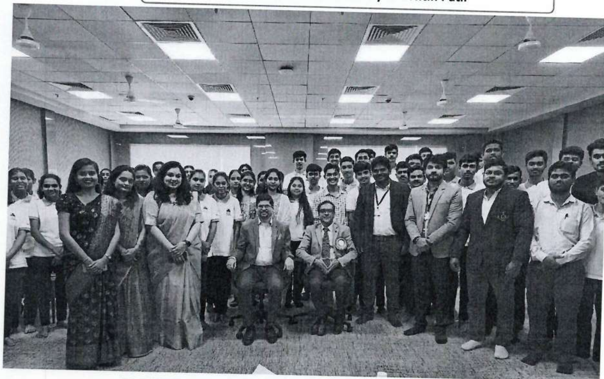
Guest, Principal Teachers and students