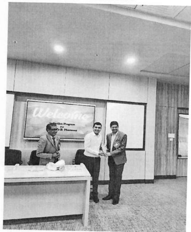
Felicitation of guests